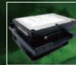
Fan can be mounted to the HDD adaptor to cool HDD