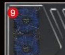
Install up to 2 x 12 or 14cm fans on side panel