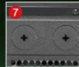
Pre-drill pipe holes for water cooling