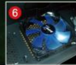
Can install 1x12 cm fan at bottom of case