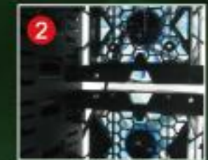
Can install 12 cm fan 1~3 pcs on front panel