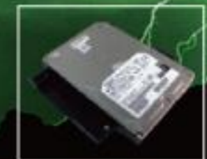
HDD can be mounted with adaptor