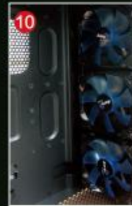
Can install 12 cm fan 1~3 pcs