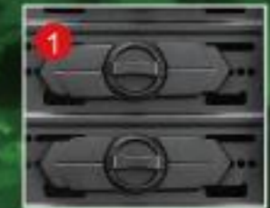
Tool-free for 5.25" bay