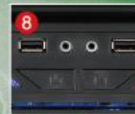
USB 2.0 x 2