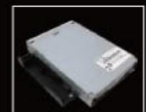
FDD can be mounted with adaptor