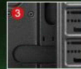
Pre-drilled holes for cable management