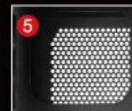
Pre-drilled hole for easy access to CPU mounting bracket