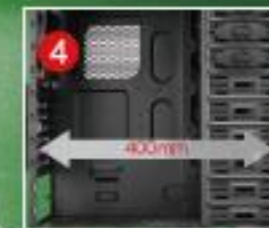
Sufficient depth of chassis for installing long cards