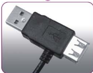
USB Extender Returns Your Laptop's USB Port