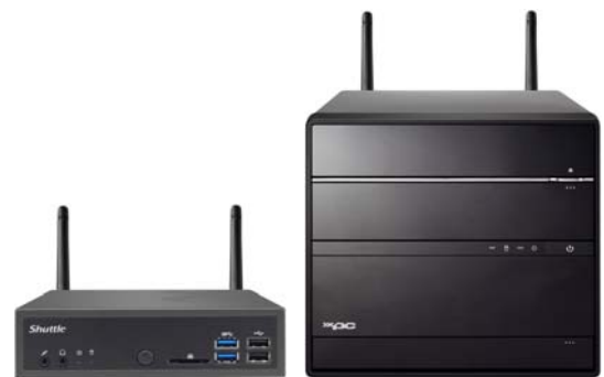
Shuttle XPC slim and XPC cube with WLN-P installed