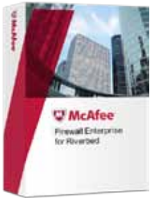
Virtual firewall to protect your virtual infrastructure

The Firewall Enterprise product line includes appliances appropriate for businesses of all sizes, as well as companion products, such as McAfee Firewall Enterprise Control Center. Our Control Center and Firewall Enterprise appliances work together to streamline management activities and reduce operational costs. Flexible hybrid delivery options include physical appliances, multi-firewall appliances, and virtual appliances. Carrier-class security performance with speeds up to 40 Gbps is delivered by our McAfee Firewall Enterprise for Crossbeam solution running on Crossbeam's X-Series hardware. Ask your sales representative for more information.