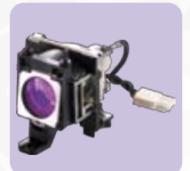
Spare Lamp Kit