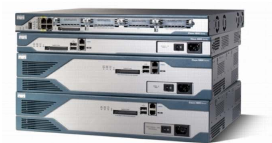
Figure 1. Cisco 2800 Series

Cisco Systems ® , Inc. is redefining best-in-class enterprise and small- to- midsize business routing with a new line of integrated services routers that are optimized for the secure, wire-speed delivery of concurrent data, voice, video, and wireless services. Founded on 20 years of leadership and innovation, the Cisco ® 2800 Series of integrated services routers (refer to Figure 1) intelligently embed data, security, voice, and wireless services into a single, resilient system for fast, scalable delivery of mission-critical business applications. The unique integrated systems architecture of the Cisco 2800 Series delivers maximum business agility and investment protection.